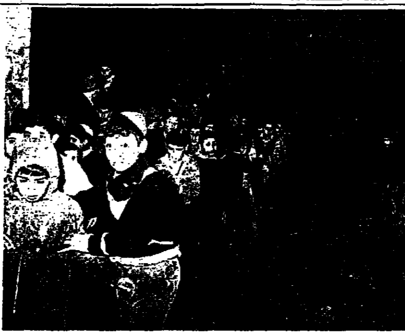
FIRE — Children from the Diskin Orphanage in Jerusalem line up outside the building as firemen work to put out the blaze inside.